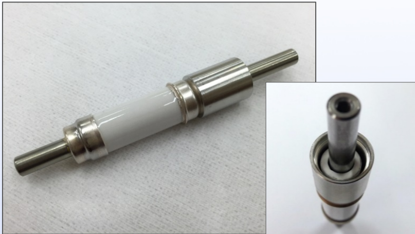
Power feedthrough with capability of 15kV, 3A